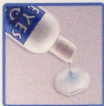
APPLY TO COTTON PAD

DIRECTIONS: Apply to cotton pad until saturated. Gently wipe off makeup with eyes closed. Repeat until makeup is thoroughly removed.