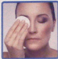
GENTLY WIPE OFF